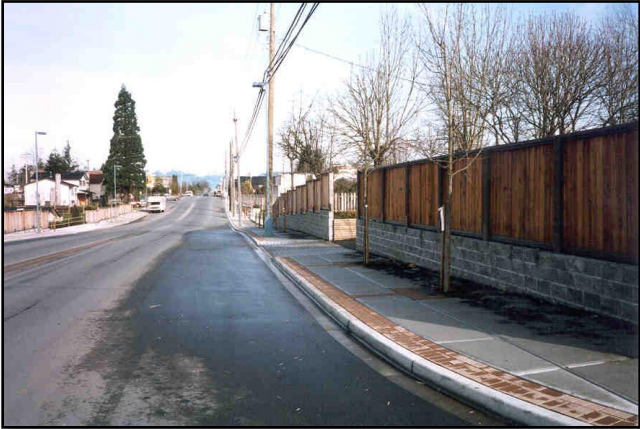
272 Street Road Upgrading, Langley