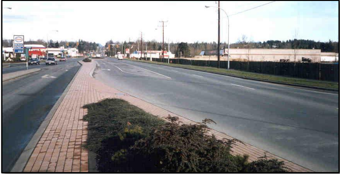
200 Street Arterial Highway, Langley