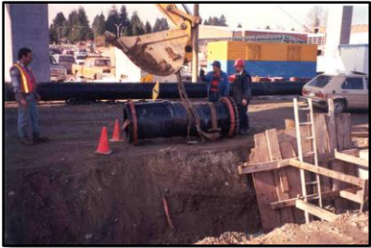
Surrey City Centre Sanitary Infrastructure Improvements, Surrey