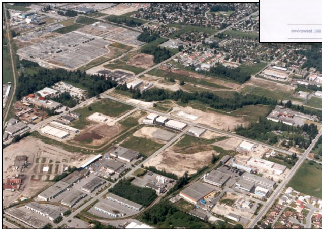
Bear Creek Industrial Park, Surrey